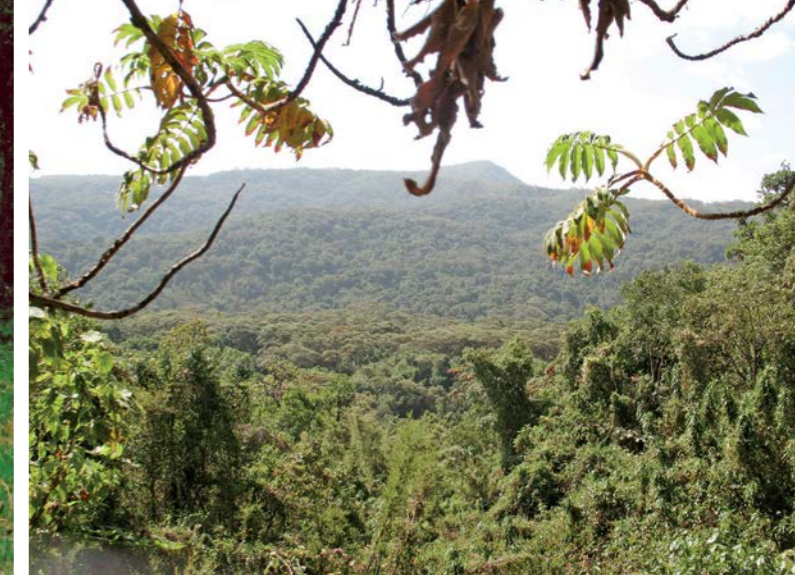
The area below Otmenna Mountain where the second Mountain nyala was shot.

It was a long wait but patience, never my strong suit, paid off. I was nodding off, my head resting on my bent