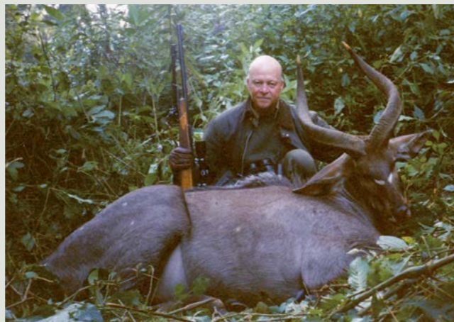
The author with his first Mountain nyala bull hunted in the Munessa Forest, south east of Addis Ababa.

In the interim, I got stuck into research on these