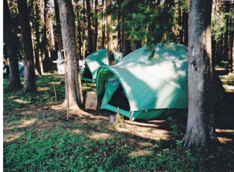
The neat tented camp on the author's second Mountain nyala hunt.

No-one who has not endured this kind of torment can understand that there is no sense of triumph, no self-congratulations, no "thrill at the kill" as animal extremists parrot on about, only a deep sense of relief and quiet satisfaction at a job, if not well done, then at least