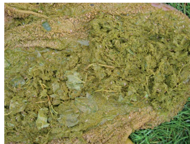
The stomach contents of a Mountain nyala, showing the variety of vegetation on which it fed.

My second Mountain nyala hunt was up in the high mountains and I have to agree with Nassos that there appear to be differences in the Mountain nyala found in the two areas. Those in the high mountains are smaller and their horns thinner, primarily I suppose because of the cold and difference in food, which is more plentiful and with a higher nutritional value in the lower forests.