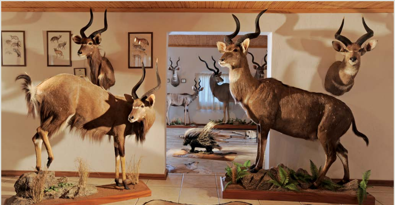
Common nyala and Mountain nyala mounts in the author's old trophy room on Bankfontein Game Ranch.

“He miss, no?” Their downcast eyes were answer enough.