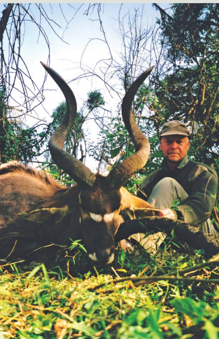
The author's second Mountain nyala bull hunted beneath the crest of Otmenna Mountain in Ethiopia.